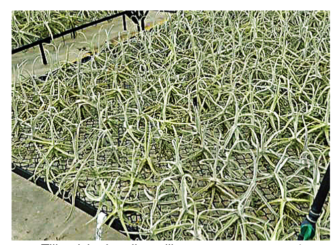
Tillandsia duratii seedlings - see note on p. 4

(Note that the yellow petals of the flowers have a purple tinged apex. They are similar to the flower petals of Tillandsia straminea shown in the insets on page 3. But the flowers of T. cacticola are not fragrant, whereas the flowers of T. straminea are highly perfumed. Editor)