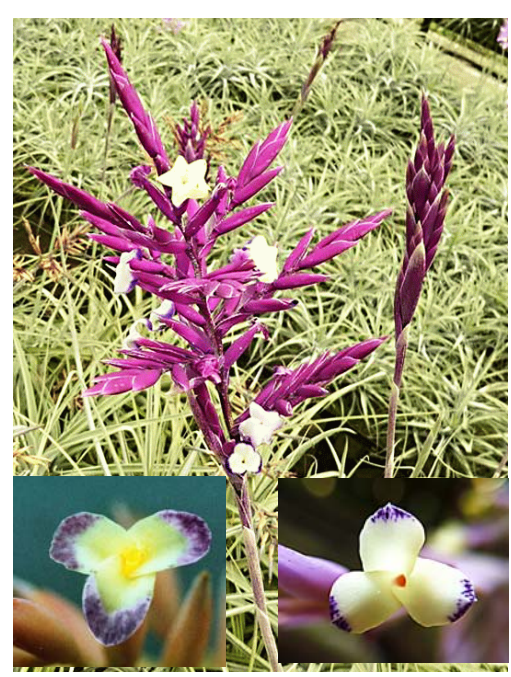
Tillandsia straminea - the left inset is its flower The right inset is the flower of T. cacticola