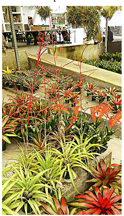
Tilandsia elongata and T. dyeriana at the La Bromelia

Aechmea chantinii. One of the several amazing forms of A. chantinii grown at the nursery. This one had lovely foliage, with less defined markings than some of the others. I'd love one of each – but it is of no use as they would not look like this here in Australia anyway. It is better to put the picture on my wall and leave the chantinii to those living in the tropics.