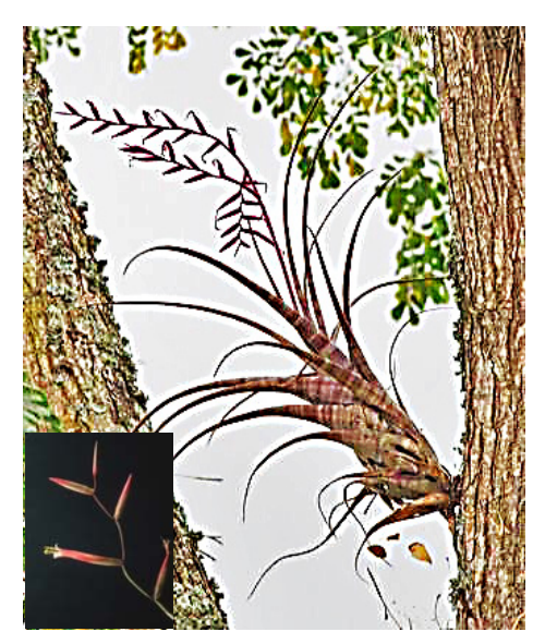
Tillandsia flexuosa - inset photo by HP

We also found our first T. flexuosa plants which was prevalent growing near T. elongata under 1,200 meters. We would see these 2 species regularly over the following three weeks, but at this time the excitement of even the most common Colombian bromeliads was still fresh. The unusual twisting shape and silver stripes with a nice spike has made T. flexuosa a much sought after plant. It is difficult to grow in southern (Australian) climes as it needs to be heated in the winter. ( It grows well in an apartment. Ed )